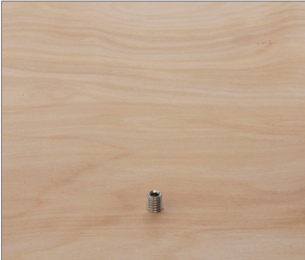
Set Fastener to Surface