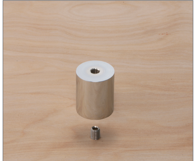
Thread Base Onto Fastener